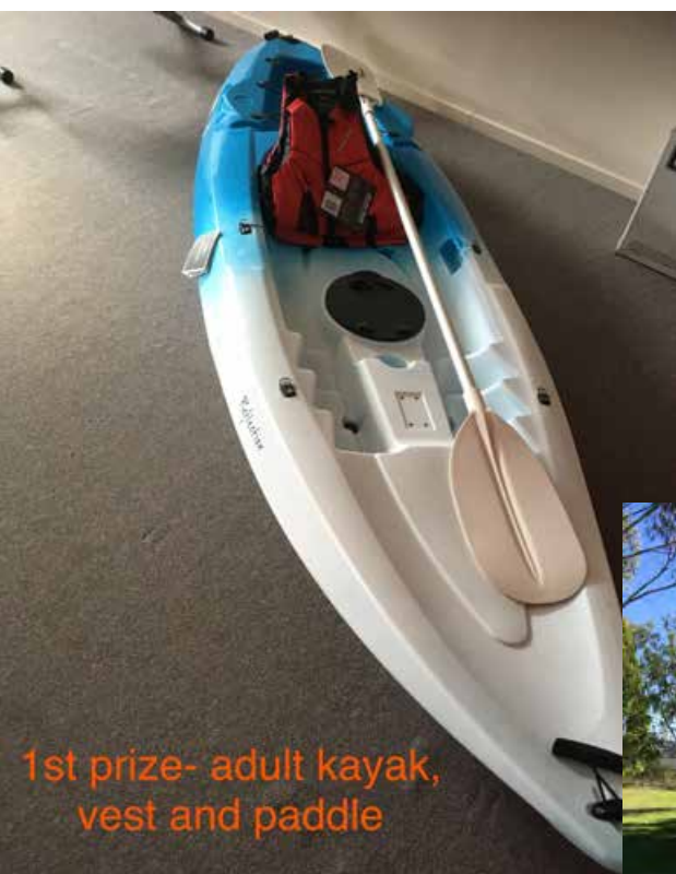
1st prize- adult kayak, vest and paddle