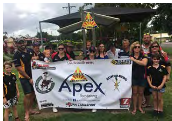
Above is Gin Gin's New Road Sign