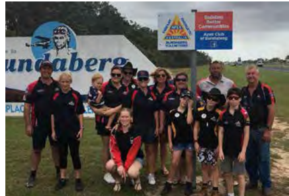
Bundaberg Airport's New Road Sign